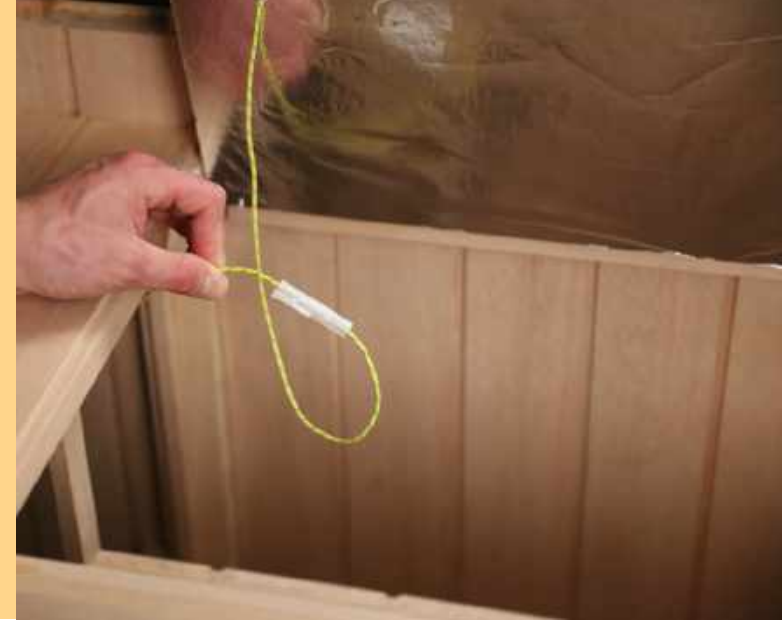
Grounding Wire Connect the yellow grounding wire from bottom side of the Right Bench to the yellow grounding wire from bottom of Left Bench. Lower the Right Bench into position