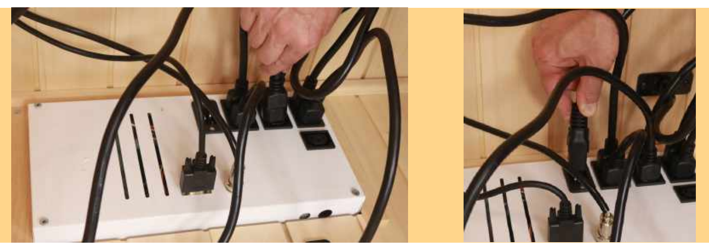
Plug in all heater leads to the receptacles in the Power Supply Box.