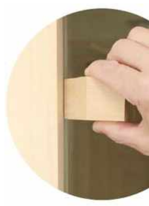
A small wooden wedge is included to help push the glazing strip into the channel if needed