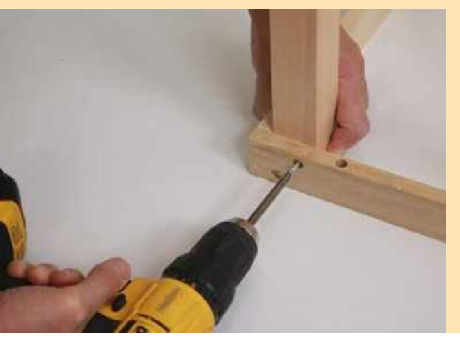
Ensure that the legs' ends are flush with the bottom edge of the frames

Connect bench legs to the inside corners of the frames using supplied wood screws.