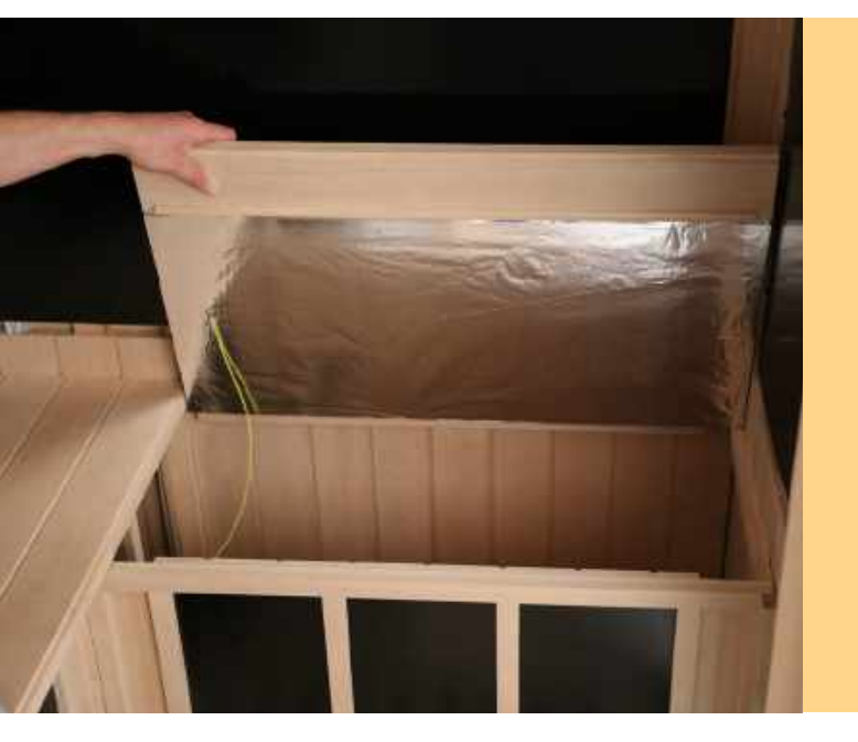
Right Bench Position the Right Bench as shown